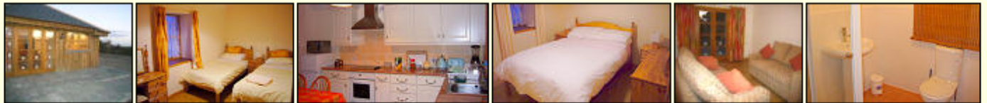
Gallery of the Cottage interior

Relax in the heart of the countryside short term or long term breaks available - contact us Now